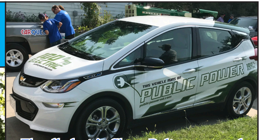
The all-electric Chevy Bolt was a popular sight at the Cuming County Fair Parade.