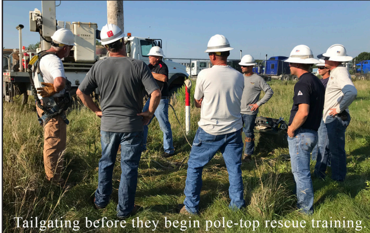
Tailgating before they begin pole-top rescue training