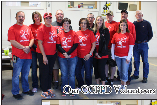
Our CCPPD Volunteers