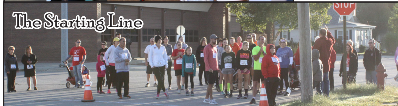
The Starting Line