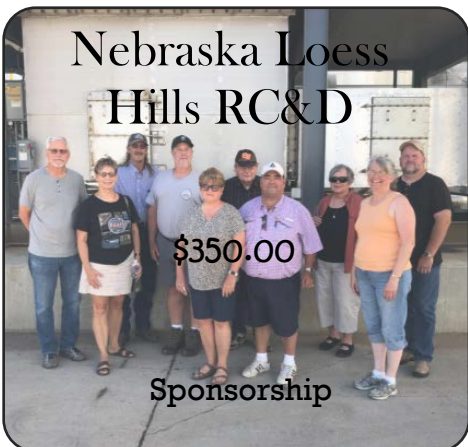
Relocation & Renovation Costs