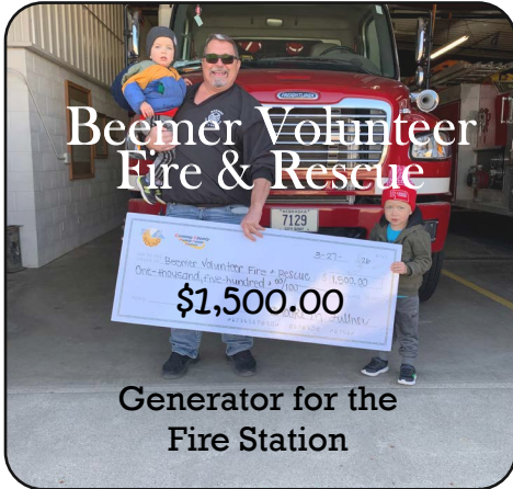
Generator for the Fire Station