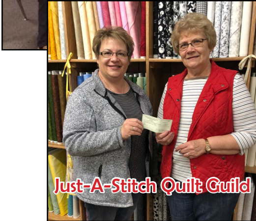
Just-A-Stitch Quilt Guild