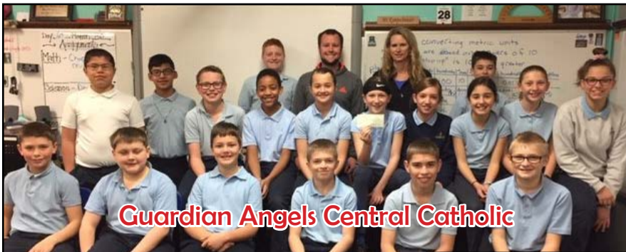
Guardian Angels Central Catholic