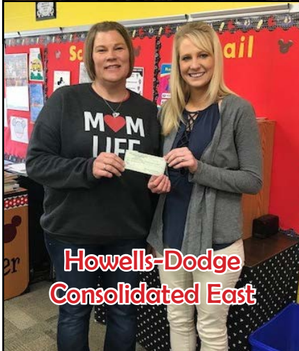
Howells-Dodge Consolidated East