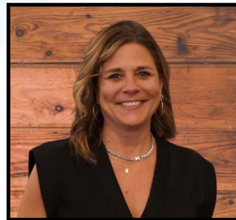
Kari Haase Equity Management Certificate Program (Level 2)