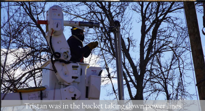
Tristan was in the bucket taking down power lines