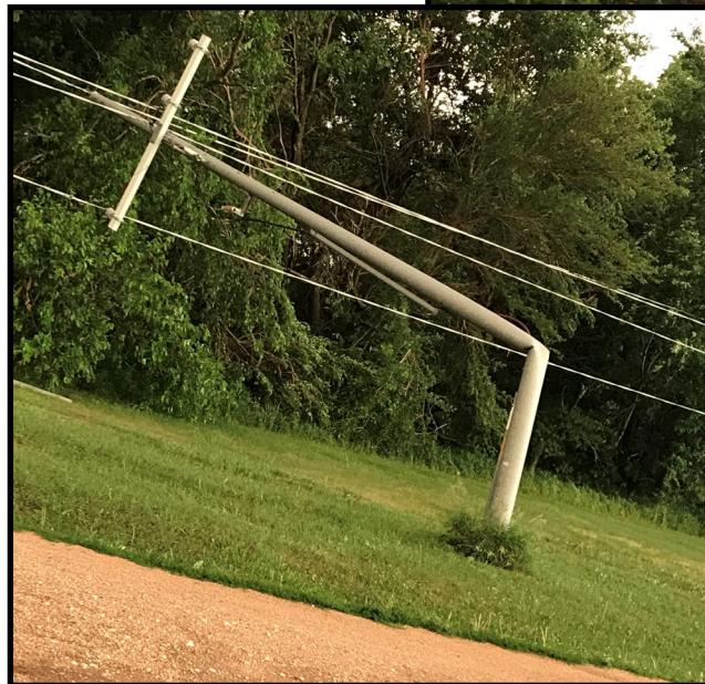
Left: A pole bent over from the powerful wind that blew through from the storm.