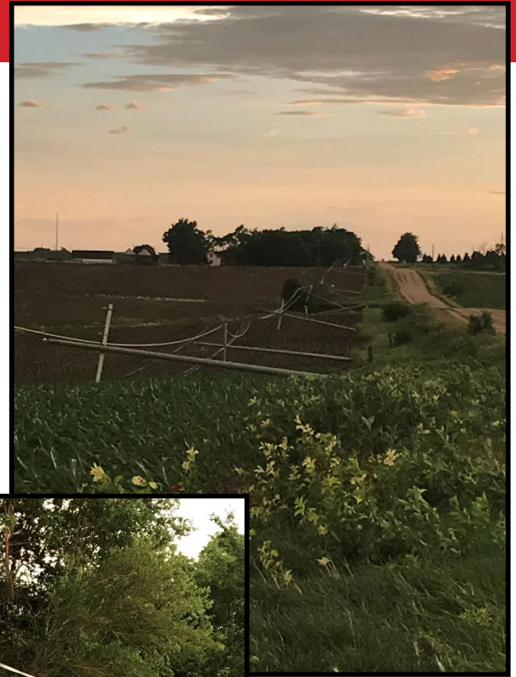
Above: A mile of poles down on the Dodge & Cuming County line.

On August 1, 2017, President Trump declared a major disaster due to severe storms, tornadoes, and straight-line winds. This declaration was authorized under the Robert T. Stafford Disaster Relief and Emergency Assistance Act. It was determined that the various weather events that occurred between June 12 and 17 were harsh enough to warrant a major disaster declaration.