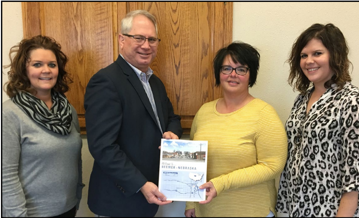
Beemer Community Guide

Here is the direct online link for the Beemer Community Guide: http://econdevtools.nppd.com/aedc/CommunityGuideLite/BeemerCGL.pdf .