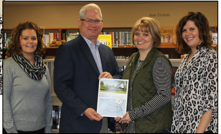
Bancroft Community Guide

Here is the direct online link for the Bancroft Community Guide: http://econdevtools.nppd.com/aedc/CommunityGuideLite/BancroftCGL.pdf .